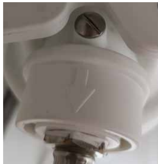
FIG3: DIRECTIONAL ARROW OF WATER FLOW

Note the arrows showing the direction of flow. The arrow points in the direction of flow to the tap. You can mount the bracket either way round according to whether you are installing on the left or the right hand side of the cupboard. Using the phillips head screwdriver, screw the bracket to the filter unit.