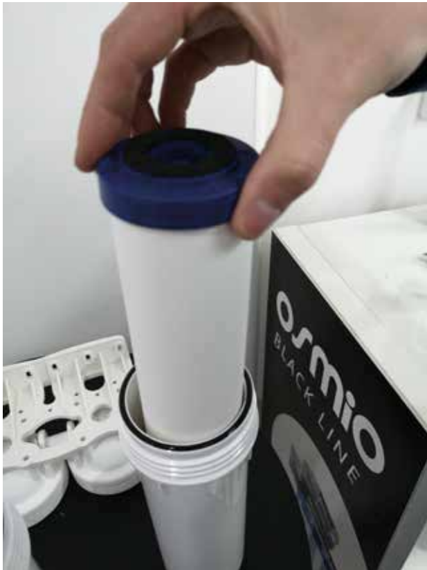
FIG6: THE RUBBER WASHER GOES ON THE TOP OF THE FILTER

Min-Max Pressure: 2 bar - 4.5 bar Recommended flow rate: < 3 LPM