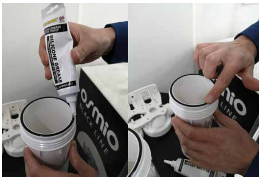
FIG4: GREASING THE O RINGS

Fist clean your hands and then apply the grease to the ring generously and run your finger around the ring as shown.