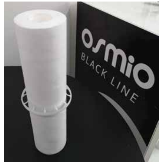
FIG5: SPACING RING IS NOT NEEDED BUT CAN BE USED WITH SEDIMENT FILTERS

Skip to the relevant section for the product you are installing. Please ensure you install the filters in the correct order shown which is in accordance with the flow directions.