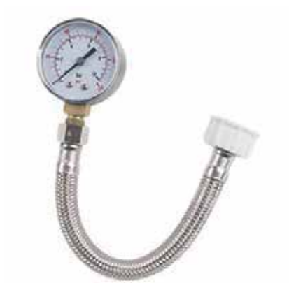
FIG1: WATER PRESSURE GAUGE