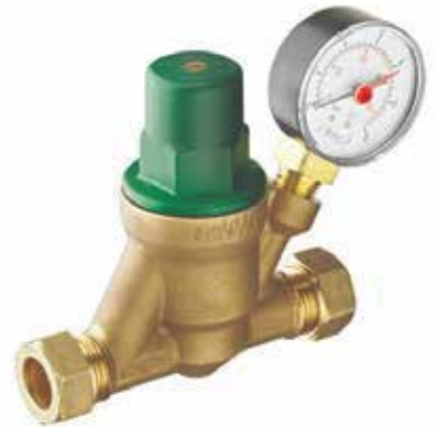
FIG2: PRESSURE REDUCING VALVE WITH GAUGE