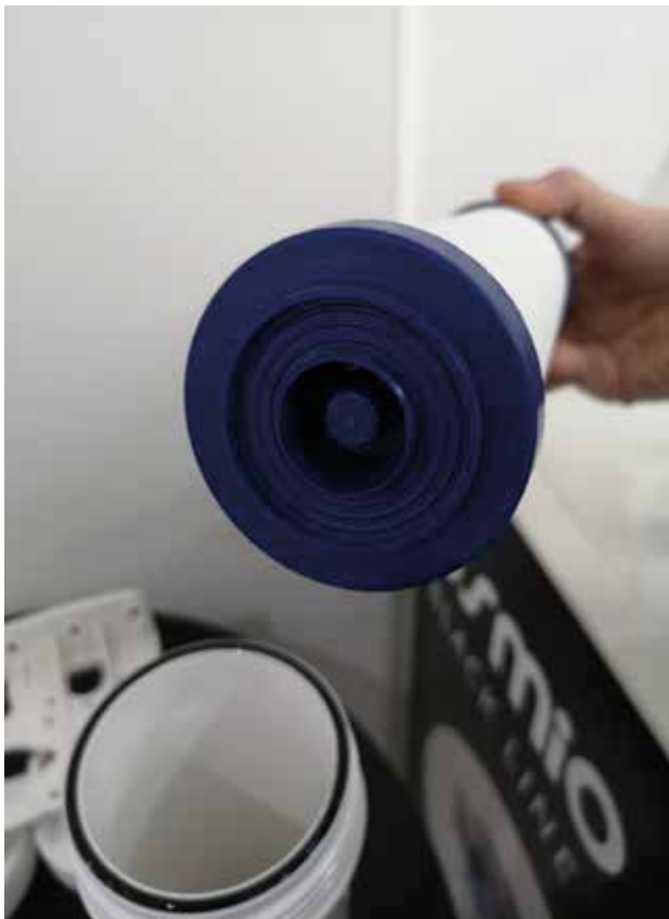
FIG7: THE BOTTOM AND CLOSED END OF THE FILTER

Filter 2: Osmio 2.5 x 10 Chlorine & Limescale Filter: As per previous section.