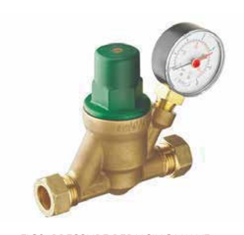
FIG2: PRESSURE REDUCING VALVE WITH GUAGE