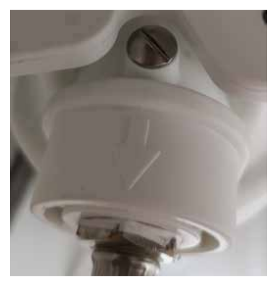
FIG3: DIRECTIONAL ARROW OF WATER FLOW

Note the arrows showing the direction of flow. The arrow points in the direction of flow to the tap. You can mount the bracket either way round according to whether you are installing on the left or the right hand side of the cupboard. Using the phillips head screwdriver, screw the bracket to the filter unit