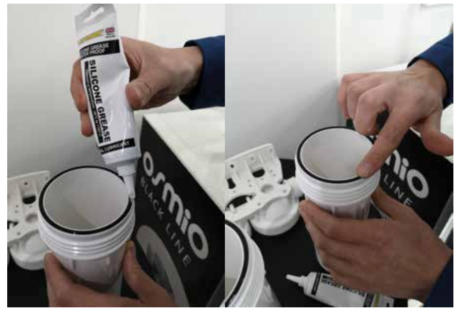
FIG4: GREASING THE O RINGS

Fist clean your hands and then apply the grease to the ring generously and run your finger around the ring as shown.