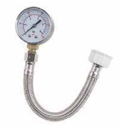
FIG1: WATER PRESSURE GUAGE

Silicone Grease (Plumber's Grease) PTFE tape Spanner & Plumbers Wrench Philips head screwdriver & Flat edge screwdriver Pressure gauge Electric drill with metal drill bits Spirit level Marker pen Appropriate screws to mount the filter to the vertical surface (e.g. wood screws)