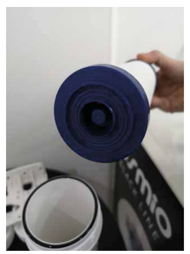
FIG7: THE BOTTOM AND CLOSED END OF THE FILTER

Min-Max Pressure: 2 bar - 4.5 bar Recommended flow rate: < 3 LPM