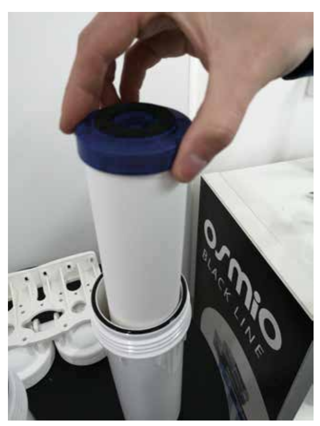
FIG6: THE RUBBER WASHER GOES ON THE TOP OF THE FILER