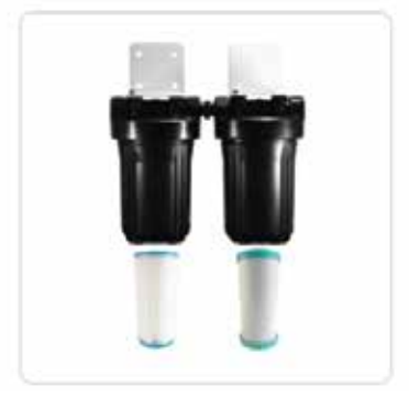
Osmio Pro 4.5 x 10 Inch Dual Whole House Filter System

Osmio 4.5 \times 10 Inch Carbon Block 5 Micron Filter Life: 37000 litres, recommended filter change every 6-12 months.