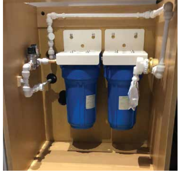
Examples of installations