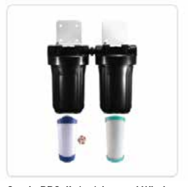
Osmio PRO-II-A- Advanced Whole House Filter System

Filter 2: Osmio Chloramine Reduction 0.5 Micron Carbon Block 4.5" x 10" Filter 2 Life: 15,000 Litres or 6 months