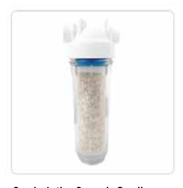
Osmio Active Ceramic Small Whole House Filter System

Suitable for 1 bathroom households with 15mm pipe and peak flow rates lower than 17 LPM.