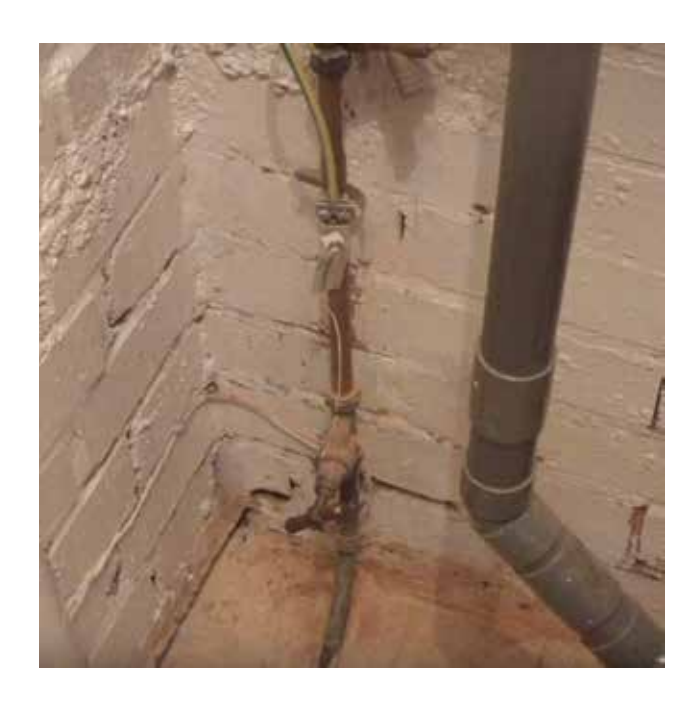
FIG 3: An example external installation before weatherproofing

Locate the rising main. If you don't already know where it is, this could be anywhere in the house, there will always be an outside one, but we are looking for an inside one, which is the point where the water comes into the house and before it branches off around the house – it could be in a basement, garage, utility room, under stairs, under the kitchen sink or somewhere else). The mains incoming stopcock usually has a yellow and green earthing cable attached to it. Make sure you know where the mains stop tap is in the street and have mains stop tap key if needed). In rare cases, there are more than one entry point and some apartments have communal hot water, providing a cold water and a hot water entry point. If this applies please contact us.