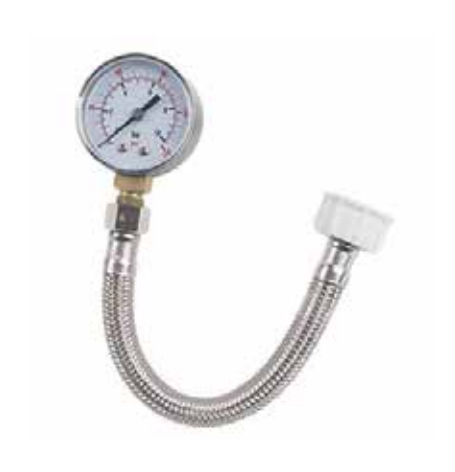
FIG1: WATER PRESSURE GUAGE

Incoming water pressure must be tested before the installation. You can do this by using a pressure gauge (available online or at plumbers merchants, an example shown FIG1). Please note that your standing water pressure can increase up to an additional 1-4 bar at night time and there is a known "hammer effect" when water supplies are turned off and back on again. We highly recommend protecting your entire property with a Pressure Reducing Valve (PRV - see FIG2) which can protect all appliances and plumbing from any increases or spikes in water pressure that can and do happen, which causes filter systems and other plumbing to leak.