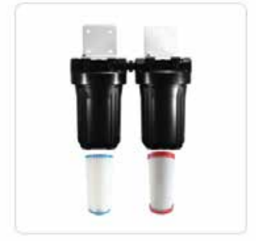
Osmio Chlorplus Whole House System

Osmio 4.5 x 10 Inch Active Ceramics Filter Filter Life: 1-3 year life or 300,000 litre capacity. Life of filter may vary depending on water hardness and local water quality.