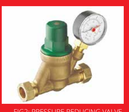
FIG2: PRESSURE REDUCING VALVE

The system must not receive more than 6.3 bar. Fit a PRV on your incoming mains to control the pressure.